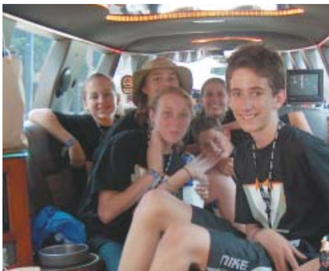
Team Capital X from San Diego is the 100,000th visitors to compete at the global level in Knoxville. They spent the day giving and getting gifts around Knoxville...but perhaps the best part was...they went in "limo style!"

Such an extraordinary team received quite the VIP treatment. They were escorted—in a limo—to several stops in Knoxville. They visited the Holiday Inn Select Downtown, Knoxville Convention Center,